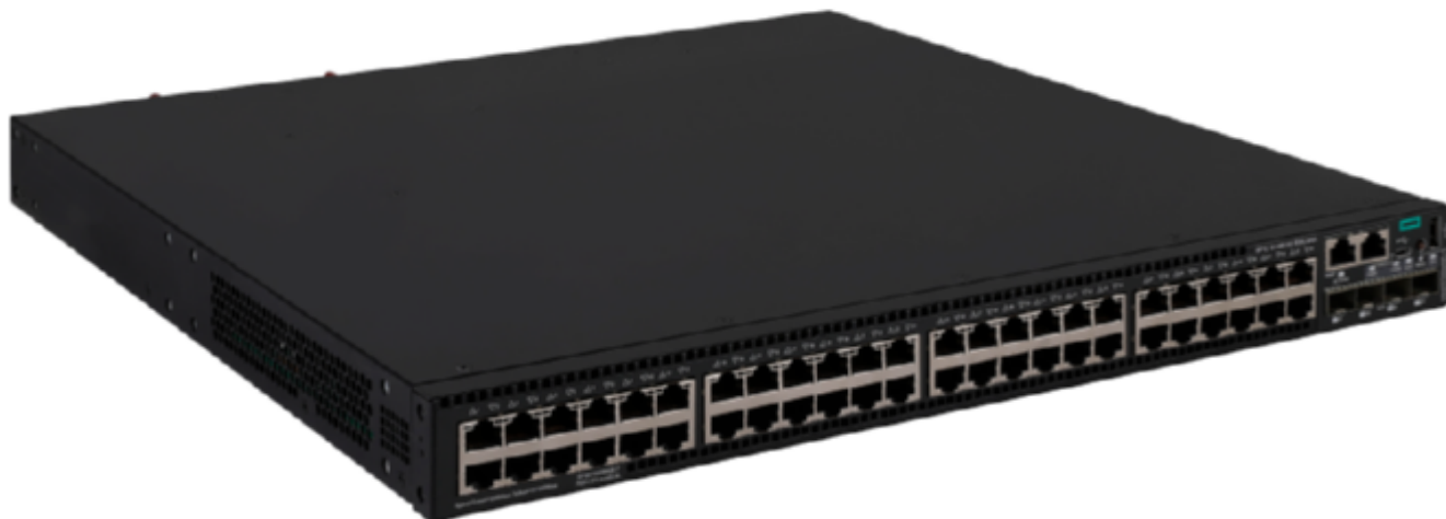
HPE Networking Comware Switch Series 5140 HI

This switch series also includes Smart MC at no additional cost and combined with Intelligent Management Center (IMC), provides both embedded network management, enhanced network visibility and automation